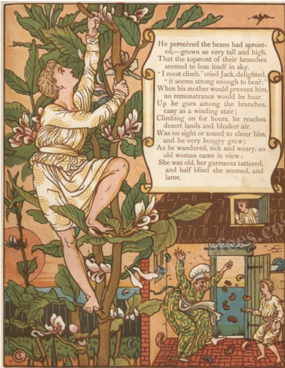
Jack and the Beanstalk – Illustration by Walter Crane

He walked to the castle and discovered that it was the home of a couple of giants, for the doors and furniture were gigantic. In the kitchen, he found the giant woman and asked her: