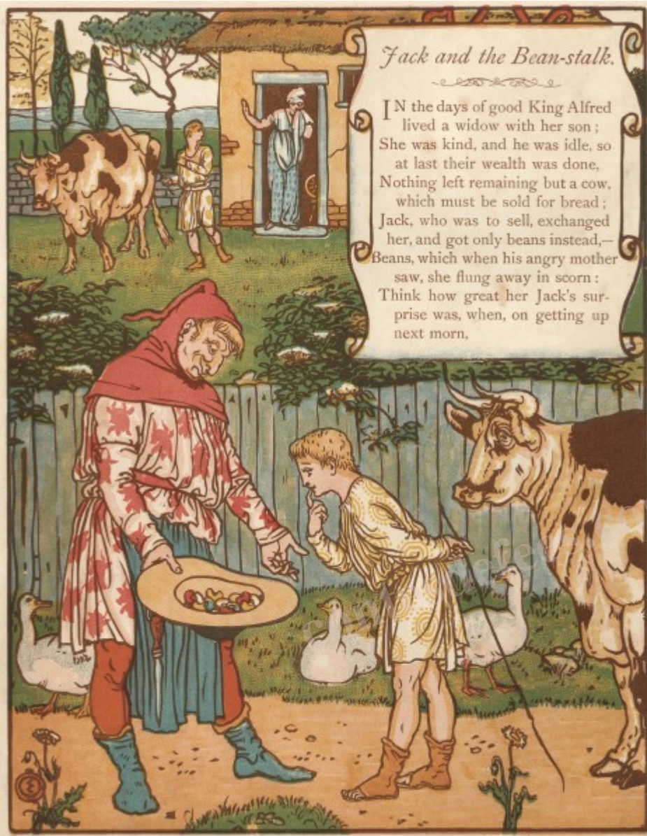
Jack and the Magic Bean – Illustration by Walter Crane

His mother became angry when she saw the beans and thought her son had been fooled by the old man.