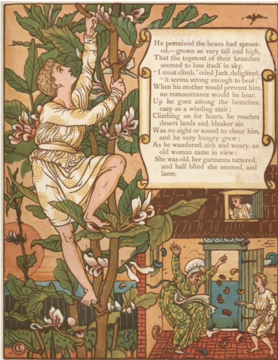
Jack and the Beanstalk – Illustration by Walter Crane

The next day, when he woke up and looked out the window, he saw that a huge plant had grown where his mother had thrown the magic beans, and was reaching up to the clouds. He climbed up the stem, holding on to the branches, and began to climb to the sky. He climbed and climbed until he reached the clouds and there, in the distance, he saw a beautiful castle.