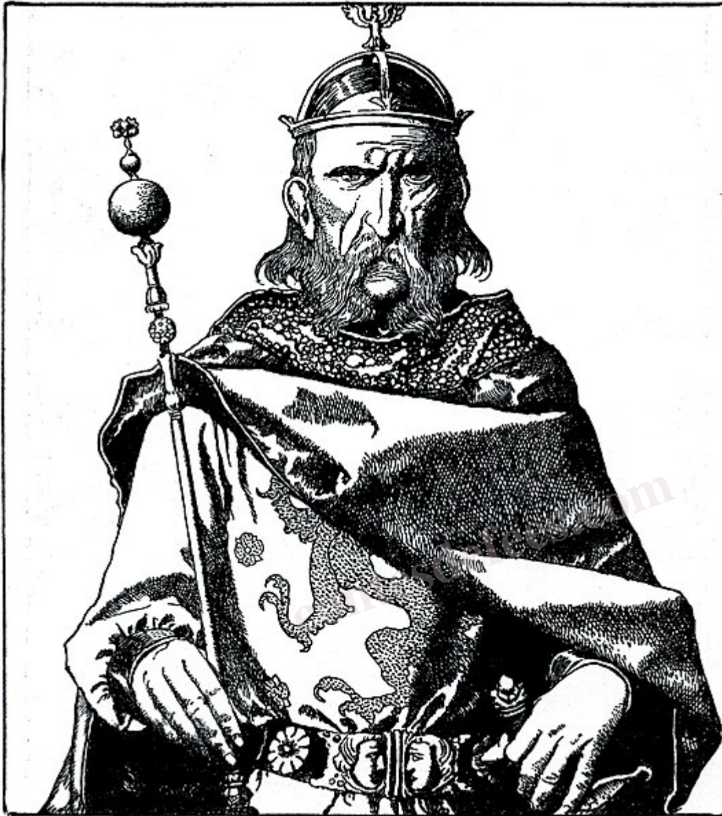
Uther Pandragon by Arthur Pyle

But when Uther Pendragon and the Duchess Igraine met, the king fell madly in love with her. He was so madly in love that he asked the court magician, Merlin the Enchanter, to cast a spell. The spell was to make Igraine believe that Uther was her true husband. And it worked so well that they were united and from their union was born a son named Arthur.