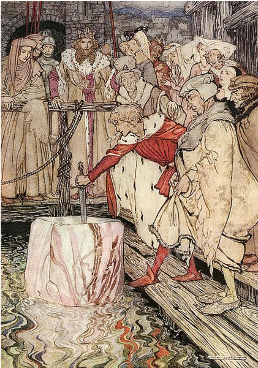
The romance of King Arthur and his knights of the Round Table. Abridged from Malory's Morte d'Arthur by Alfred W. Pollard. Illustrated by Arthur Rackham. Published 1920 by Macmillan in New York